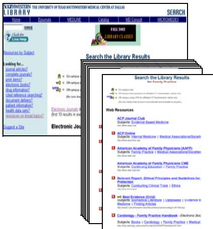
The Library Web page's search engine creates a long list of family practice resources on the Web.

The Family Practice Guide targets the best and most useful, rather than attempting to be comprehensive, so users don't have to wade through long lists of sites. It includes sections on electronic books and journals, drugs, patient education, guidelines and evidence based medicine, links to professional associations, grants information, and CME opportunities in Family Practice. The Guide also contains a link to the new Web-based residency curriculum program. Feedback from a variety of Family Practice faculty further increased the Practice Guide's relevance. Library staff maintain the links and the Library's content liaison continues to elicit feedback from family practitioners to suggest additional resources for possible inclusion.