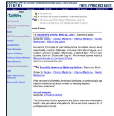
The new Family Practice Guide is a highly selective list of Web-based family practice resources.