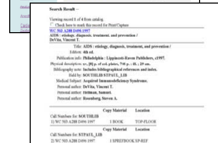
The AAFP Recommended Book List searches the Library's catalog for resources appearing on the list.