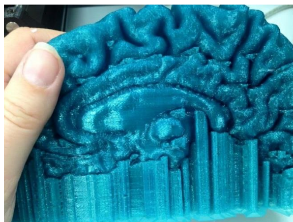
Figure 1 3D print from an MRI scan of the right hemisphere of a brain UT Southwestern Health Sciences Digital Library and Learning Center

Researchers have also partnered with libraries in using 3D printing to develop tools that are customized to their research objectives and may not be affordable or available elsewhere. For instance, these tools include mechanisms developed to measure joint reflexes and to test grip and wrist dexterity. The latter mechanism involves a patient lifting a ball from its resting place